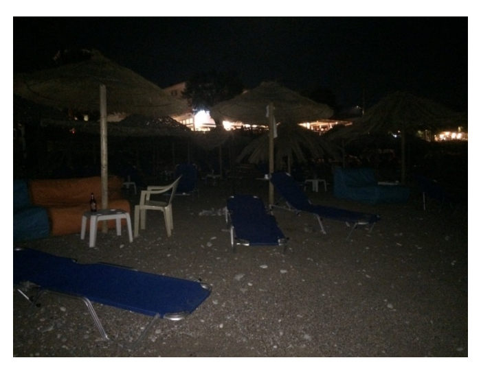
Picture 6. Photo-pollution: lights in direct proximity to the nesting beach. The management of beach furniture in Kalo Nero village took place only occasionally during 2017 nesting season.