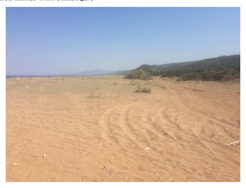
Picture 2. Access routes to the beach in the Dunes of Kyparissia area