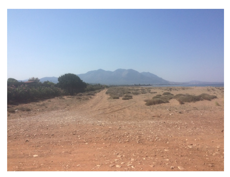
Picture 3. Access routes to the beach in the Dunes of Kyparissia area