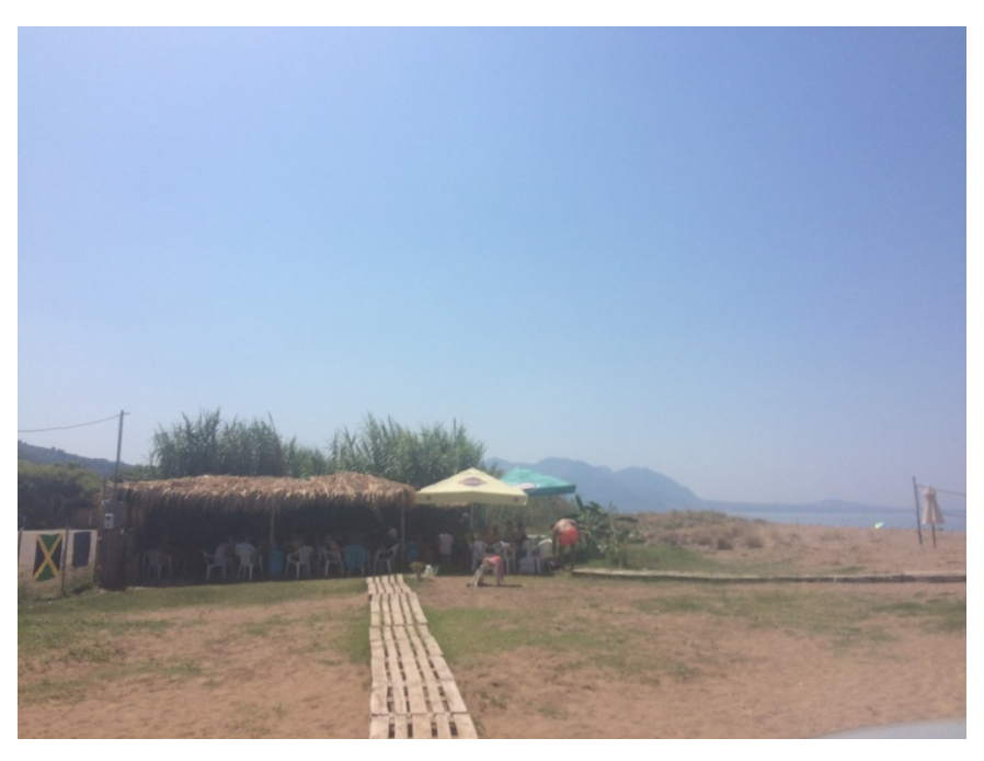
Picture 9: Canteen, wooden platforms and beach volley net next to the beach in front of Elaia village.